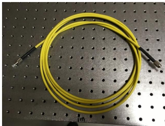
PMC Patchcord with FC connectors

The PMC Patchcord is your ideal partner for nonlinear imaging, OCT, distortion-free ultrafast laser fiber delivery, sensors, spectroscopy